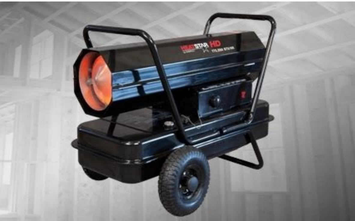
Heatstar by enerco manual.